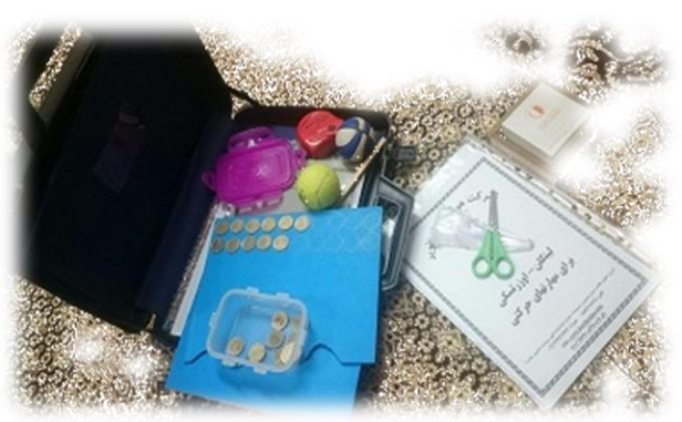
Figure 1. Instruments and administration of the test