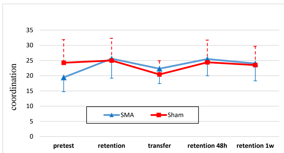
Figure 2. Mean and standard deviation of bimanual coordination of tACS and sham conditions in various tests